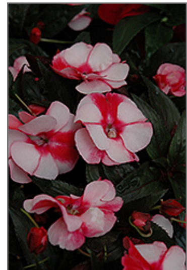
Sonic Sweet Cherry New Guinea Impatiens flowers