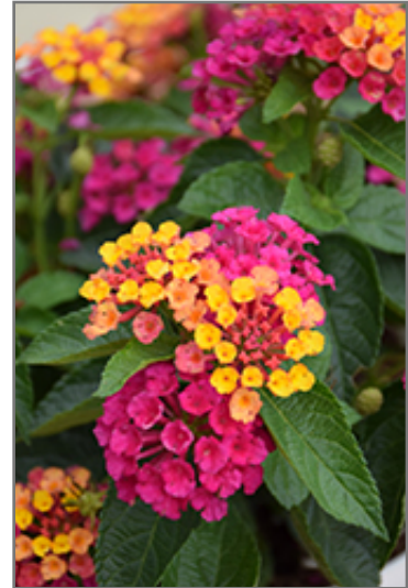
Luscious Royale Cosmo Lantana flowers

Luscious Royale Cosmo Lantana is recommended for the following landscape applications;