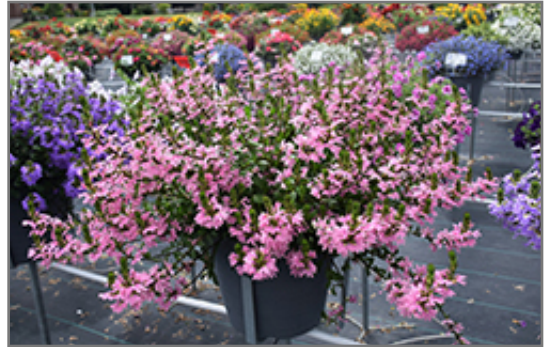
Whirlwind Pink Fan Flower in bloom

Whirlwind Pink Fan Flower will grow to be about 12 inches tall at maturity, with a spread of 24 inches. When grown in masses or used as a bedding plant, individual plants should be spaced approximately 12 inches apart. Its foliage tends to remain dense right to the ground, not requiring facer plants in front. Although it's not a true annual, this fast-growing plant can be expected to behave as an annual in our climate if left outdoors over the winter, usually needing replacement the following year. As such, gardeners should take into consideration that it will perform differently than it would in its native habitat.