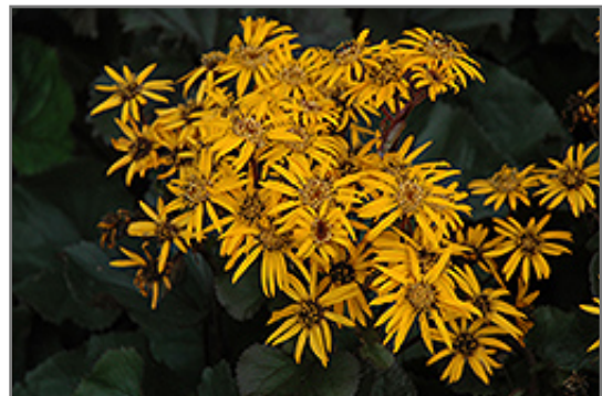
Britt Marie Crawford Rayflower flowers