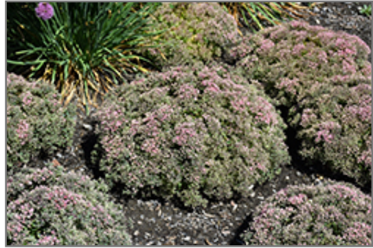
Rock 'N Round Pride and Joy Stonecrop in bloom