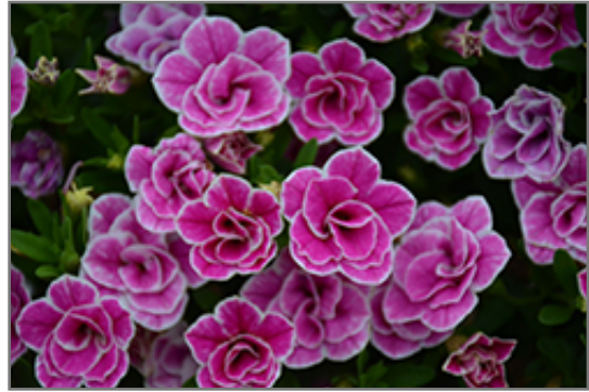
Superbells Doublette Love Swept Calibrachoa flowers

Superbells Doublette Love Swept Calibrachoa is a dense herbaceous annual with a trailing habit of growth, eventually spilling over the edges of hanging baskets and containers. Its medium texture blends into the garden, but can always be balanced by a couple of finer or coarser plants for an effective composition.