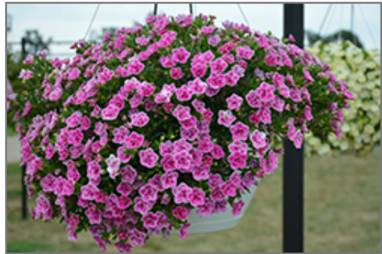
Superbells Doublette Love Swept Calibrachoa in bloom