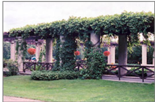
Virginia Creeper