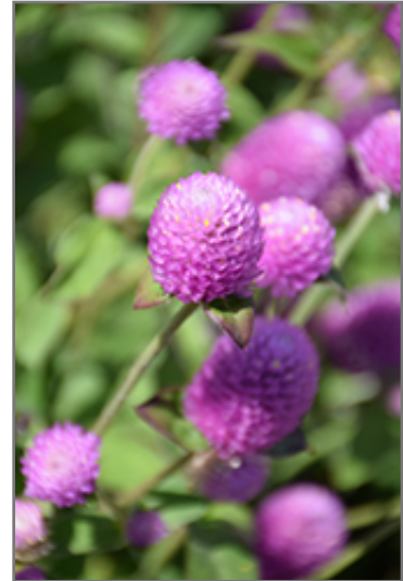
Ping Pong Lavender Globe Amaranth flowers

Ping Pong Lavender Globe Amaranth is recommended for the following landscape applications;