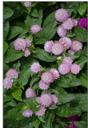
Ping Pong Lavender Globe Amaranth flowers