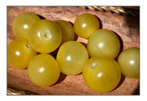
Gold Nugget Tomato fruit

Gold Nugget Tomato will grow to be about 24 inches tall at maturity, with a spread of 24 inches. When planted in rows, individual plants should be spaced approximately 24 inches apart. Because of its vigorous growth habit, it may require staking or supplemental support. This fast-growing vegetable plant is an annual, which means that it will grow for one season in your garden and then die after producing a crop.