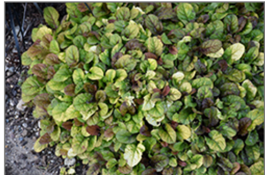
Feathered Friends Parrot Paradise Bugleweed