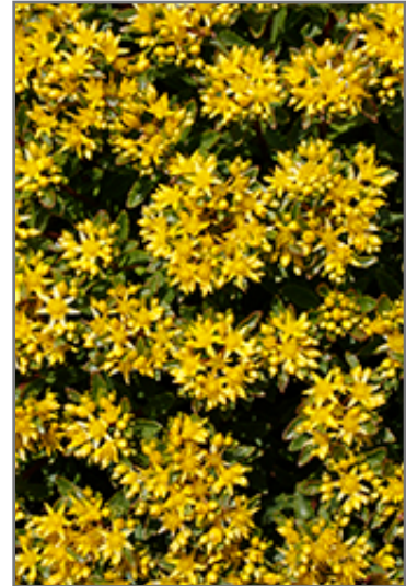
Rock 'N Round Bright Idea Stonecrop flowers

This is a relatively low maintenance plant, and is best cleaned up in early spring before it resumes active growth for the season. It is a good choice for attracting bees and butterflies to your yard, but is not particularly attractive to deer who tend to leave it alone in favor of tastier treats. It has no significant negative characteristics.