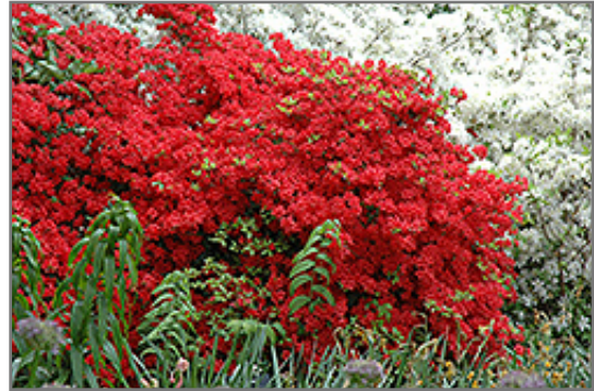
Stewartstonian Azalea in bloom