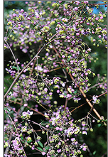
Rochebrun Meadow Rue flowers