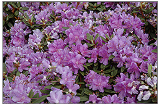
Purple Gem Rhododendron flowers