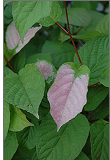
September Sun Kiwi foliage

September Sun Kiwi is recommended for the following landscape applications;