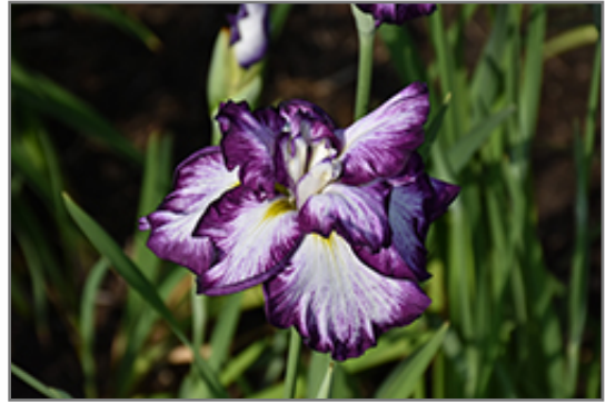
Lion King Japanese Flag Iris flowers

This plant will require occasional maintenance and upkeep, and should be cut back in late fall in preparation for winter. Deer don't particularly care for this plant and will usually leave it alone in favor of tastier treats. Gardeners should be aware of the following characteristic(s) that may warrant special consideration;