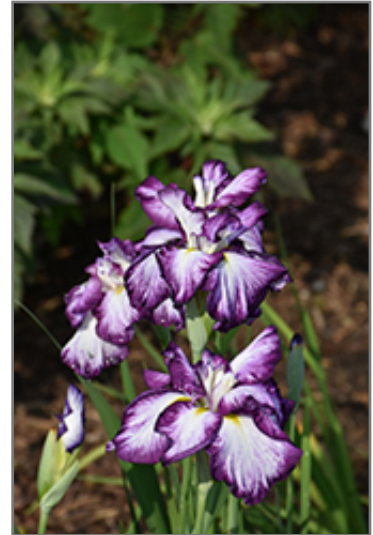
Lion King Japanese Flag Iris flowers