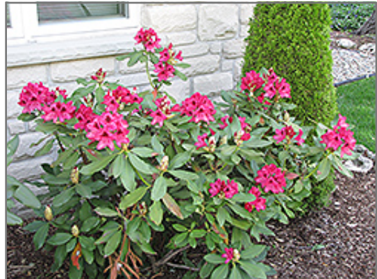
Nova Zembla Rhododendron in bloom