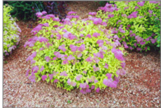
Goldmound Spirea in bloom

This shrub should only be grown in full sunlight. It prefers to grow in average to moist conditions, and shouldn't be allowed to dry out. It is not particular as to soil type or pH. It is highly tolerant of urban pollution and will even thrive in inner city environments. This is a selected variety of a species not originally from North America.