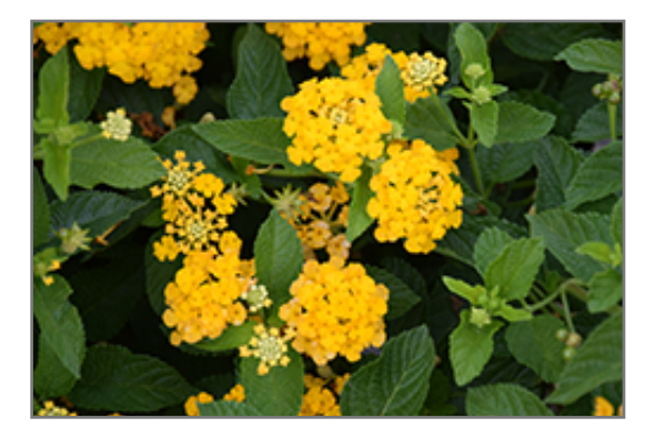
Luscious Goldengate Lantana flowers