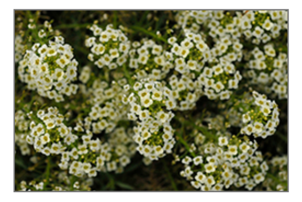
Moonlight Knight Alyssum flowers

Moonlight Knight Alyssum is recommended for the following landscape applications;