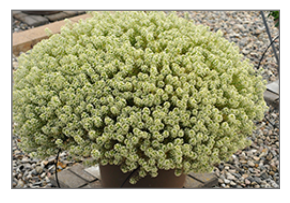
Moonlight Knight Alyssum in bloom