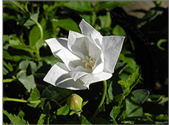
Hakone Double White Balloon Flower flowers

Hakone Double White Balloon Flower will grow to be about 18 inches tall at maturity extending to 24 inches tall with the flowers, with a spread of 18 inches. When grown in masses or used as a bedding plant, individual plants should be spaced approximately 15 inches apart. It grows at a medium rate, and under ideal conditions can be expected to live for approximately 10 years. As an herbaceous perennial, this plant will usually die back to the crown each winter, and will regrow from the base each spring. Be careful not to disturb the crown in late winter when it may not be readily seen!